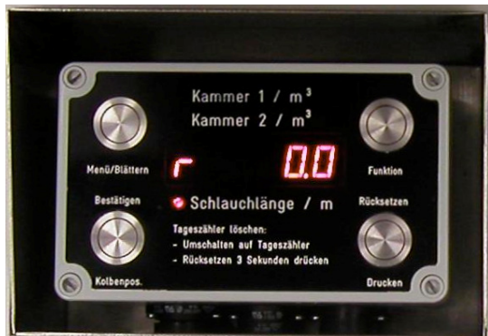
Combined device filling volume / tube length